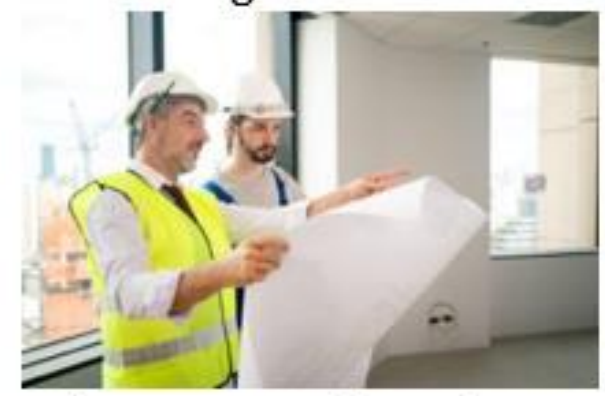
Fire Doors and Coatings